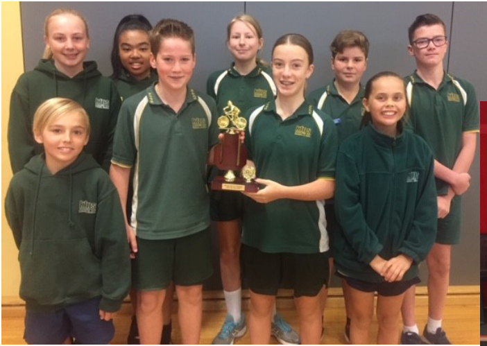
Principal Awards Congratulations to last week's Principal Award recipients.

Bike Challenge Congratulations to our Bike Challenge Team. We are very proud of they achievements and of our sportsmanship. Well done.